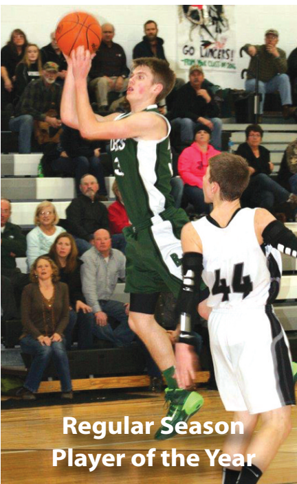
Regular Season Player of the Year