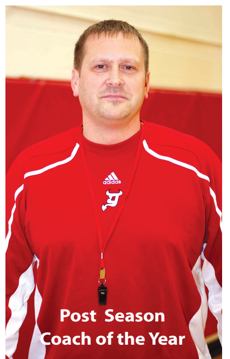
Post Season Coach of the Year