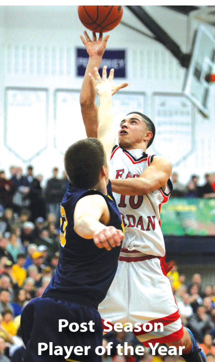
Post Season Player of the Year