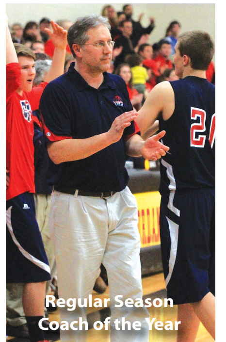
Regular Season Coach of the Year